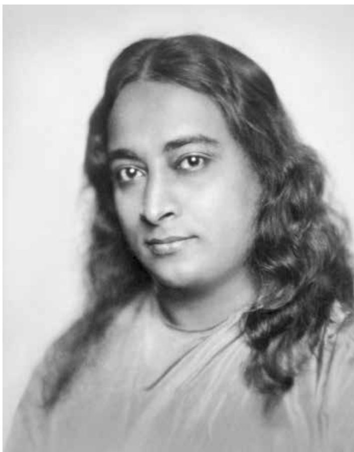
PARAMAHANSA YOGANANDA (1893-1952)