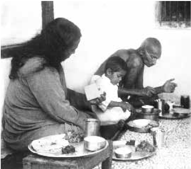
Paramahansa Yogananda and Mahatma Gandhi Wardha, India, 1935

meditation groups. If you are unable to attend these services, or if you are a follower of another spiritual teaching, you may wish to have a private service each week in your own home (see instructions on page 20). As mentioned earlier, the basic principles of prayer and healing described in this booklet are applicable by anyone, regardless of religious affiliation. If you wish to participate in the Self-Realization Fellowship Worldwide Prayer Circle, please see the registration form at the back of this booklet.